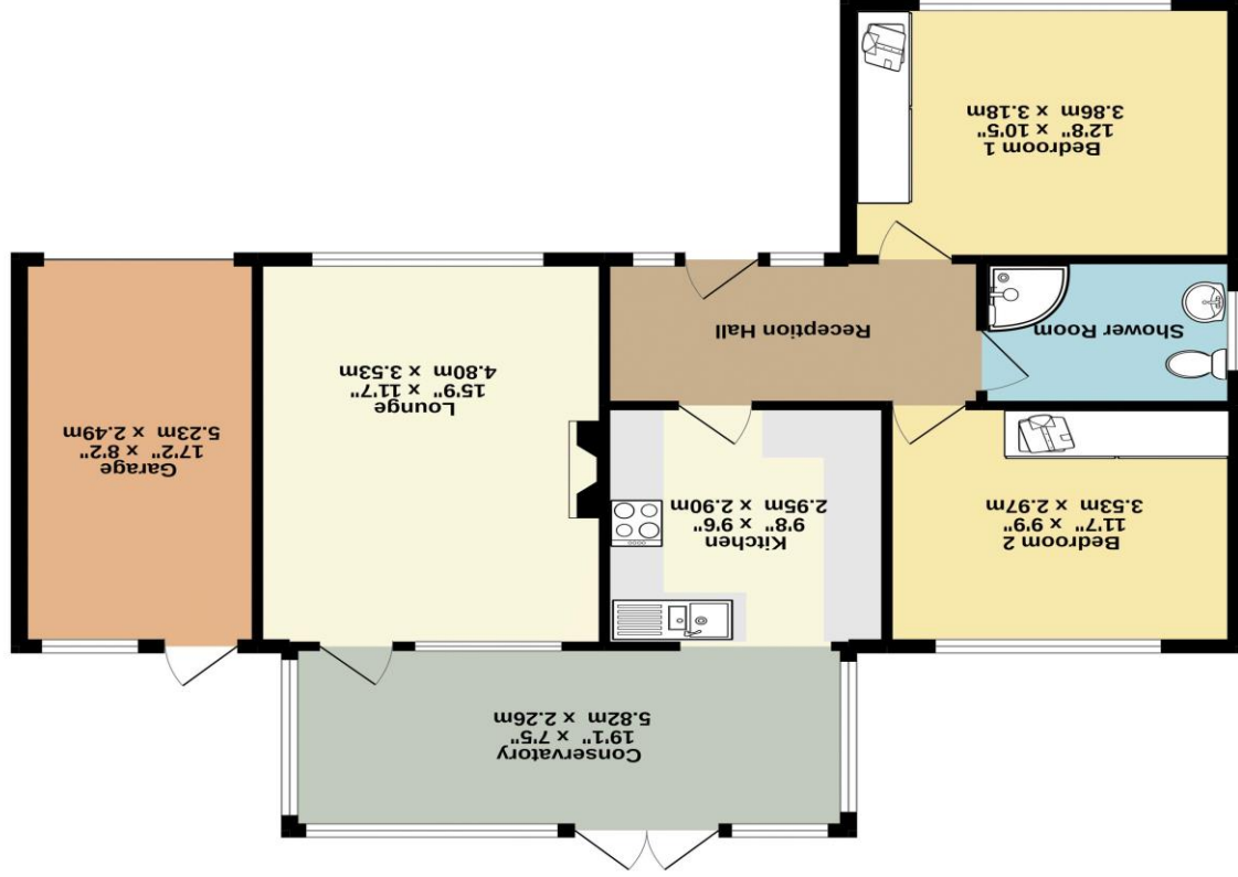
GROUND FLOOR 958 sq.ft. (89.0 sq.m.) approx.

TOTAL FLOOR AREA: 958 sq ft (89.0 sq.m.) approx. While every attempt has been made to ensure the accuracy of the figures contained here, measurements of doors, windows, rooms and any other items are approximate and no responsibility is taken for any error or mis-statement. This plan is for illustrative purposes only and should not be used as such by any prospective purchaser. The services, systems and appliances shown have not been tested and no guarantee as to their operability or efficiency can be given. Made with hertops ©2022